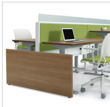
Laminate end panels available in 24", 30" and 36" heights. 24" shown