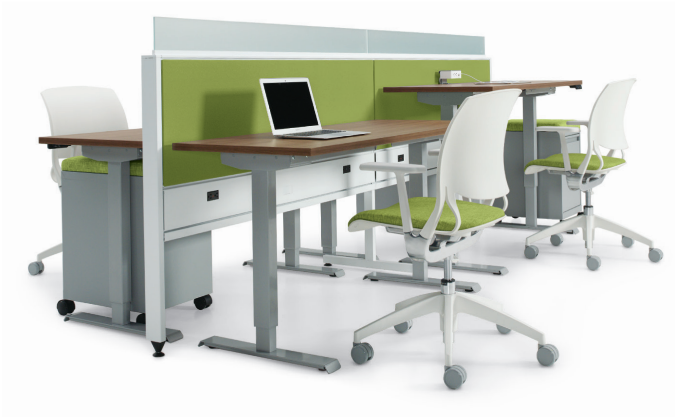
24" Intelli Beam shown with 18" fabric extension kits and 6" frosted privacy glass. Panel fabric shown in Anchorage, Green Olive. Foli height adjustable tables, 9300 mobile pedestals and Novello seating shown.