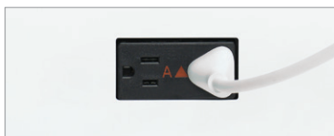
Duplex receptacle available in Black and White