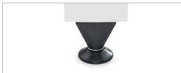
Leveling glides extend 1.25" long