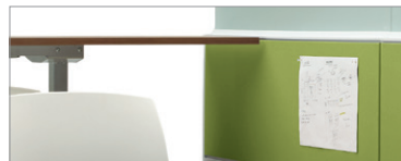
Fabric extension kits are tackable