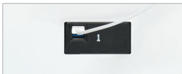
USB duplex available in Black and White