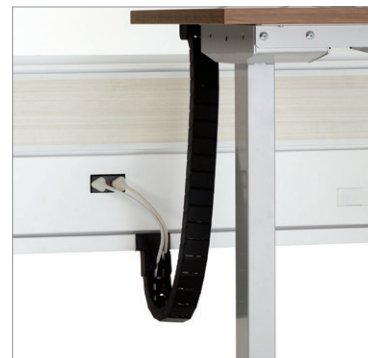
Optional energy chain manages power from the raceway to any table

Please visit globalfurnituregroup.com for additional product information including environmental certifications.